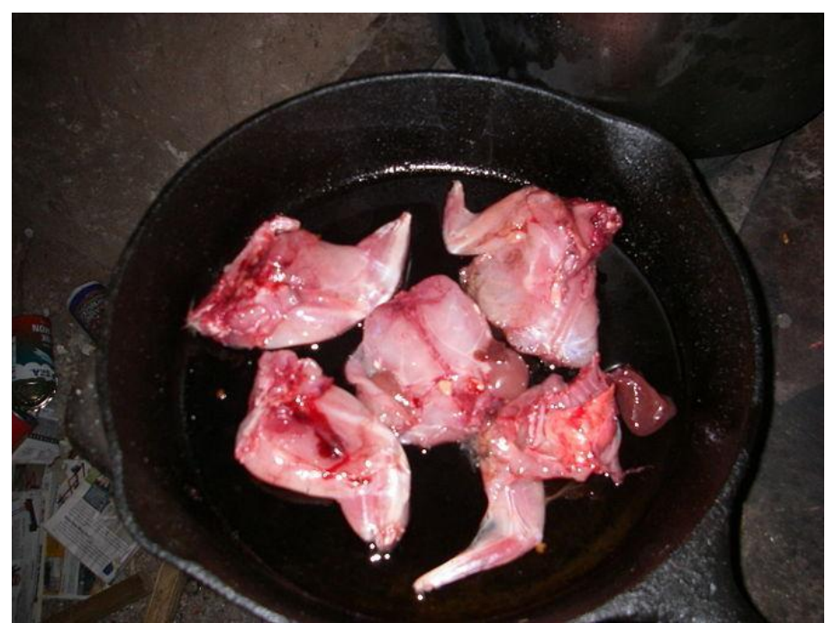
Rabbit meat provides an accessible and nutritionally viable source of protein in rural Guatemala.