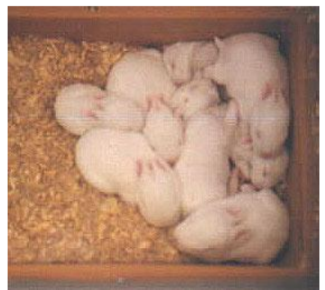
A birthing box keeps new-born rabbits contained and comfortable during early stages of growth.

After the birth and once the female is calm, the bed should be checked to remove the dead, deformed, and very small kits. This should be carried out calmly by one person known to the animal. If scared, the female may abandon her kits.