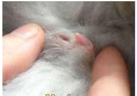
Male sexual organ